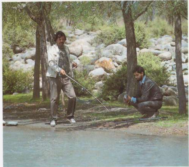
The trout is a wily creature, and requires all the angler's skills. But it is in plentiful supply.

varies from 3,000 to 5,425 metres above sea level. Prime viewing time for the upper areas is from May to August. In the lower areas, for bird viewing the best time is March to May and for animal viewing from September to March. Accommodation in two-bedroomed huts is available. For passes contact the Regional Wildlife Warden, Srinagar.