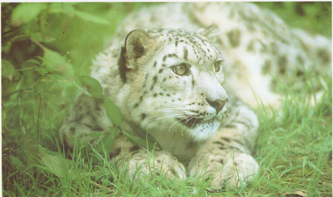
The elusive snow leopard. Opposite, the state is home to many rare species of deer.