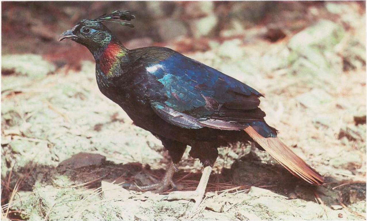
The splendidly plumaged Kaleej pheasant. Opposite, Kashmir offers serene delights to the angler.

and Sanctuaries have been established in the state. They are briefly described below.