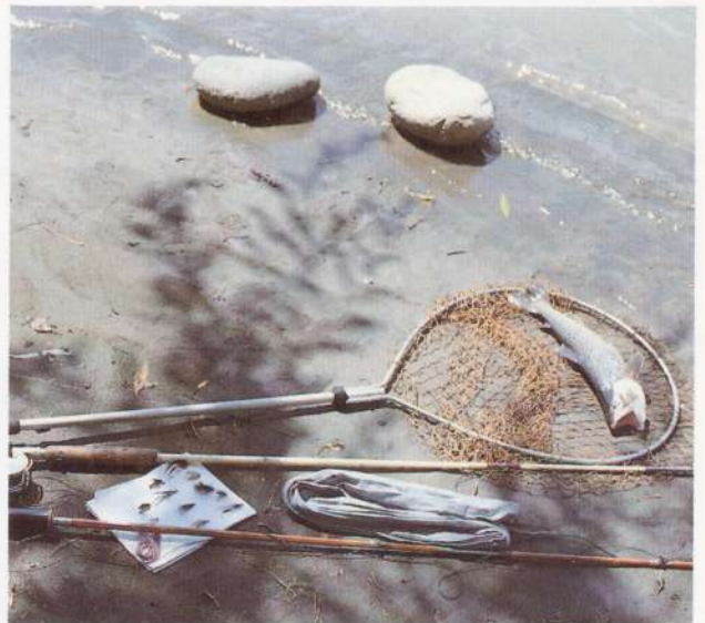
Only reels and flies are required on Kashmir's rivers. Fisheries officials are always at hand to advise.

into thinking that fishing in Kashmir is the somewhat somnolent sport that it is elsewhere, for the trout is a crafty fish, and you will have to practise all your skill to get him to bite.